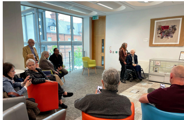
Some audience members during the presentations.