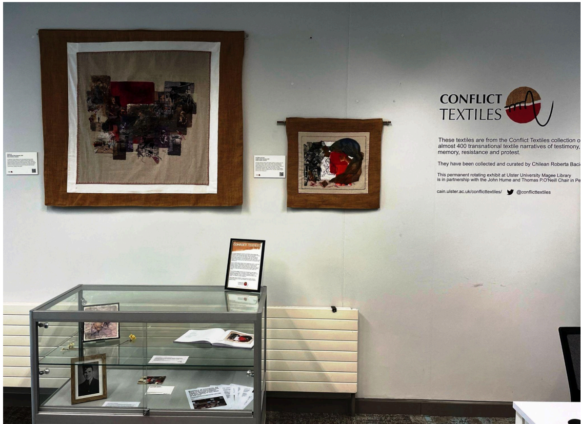
Overview of Eileen's 2 textiles on display and showcase with ad-hoc memorabilia